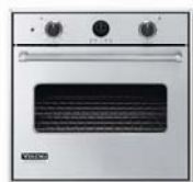
Wall Oven $500