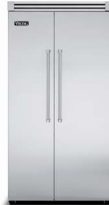
Built-in Refrigerator $750