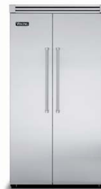
Built-in Refrigerator $750