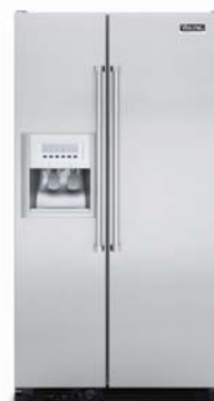
Free-standing Refrigerator $250