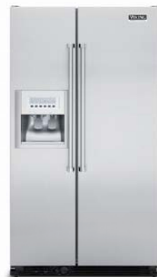
Free-standing Refrigerator $250