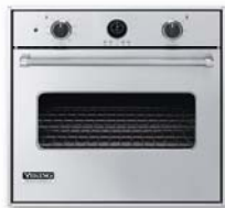
Wall Oven $500