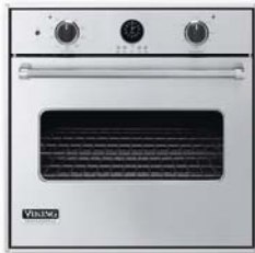
Wall Oven $500