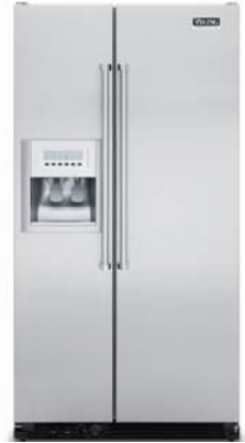
Free-standing Refrigerator $250