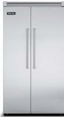
Built-in Refrigerator $750